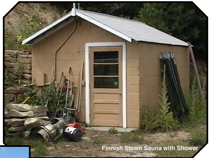
Finnish Steam Sauna with Shower

Relax and let your cares fall away in this Finnish Sauna. It also has a shower and dressing room. Heat the rocks with wood and then steam away!